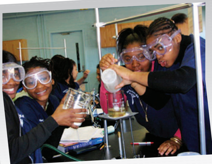
Students engaged in coteaching in a chemistry laboratory. The two students on the left instruct the students on the right on the lab procedures.